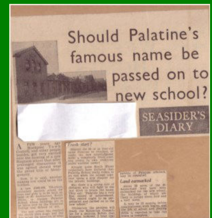
Newspaper Article from 1964